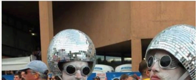
Impressions of Street Parade 2017 Love Never Ends

. Impressions of Street Parade 2017 Love Never Ends Street Parade 2017 was a huge event in Zurich with over 900,000 visitors, party-goers and revellers! The cooler temperatures meant there were fewer cases of heat exhaustion which was good news for the emergency services – and a little more pleasant for everyone dancing their ... Continue reading Impressions of Street Parade 2017 Love Never Ends