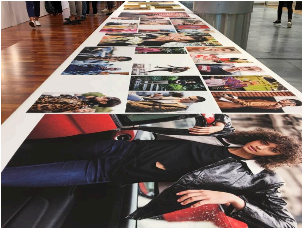
Photo 18 Fashion Showcase

Filed in "New In Zurich" , Arts and Entertainment , Exhibitions and Events , Family , Fashion , Free , Outside Zurich , Switzerland , Things To Do , What's On by newinzurich on August 18, 2017 • 0 Comments